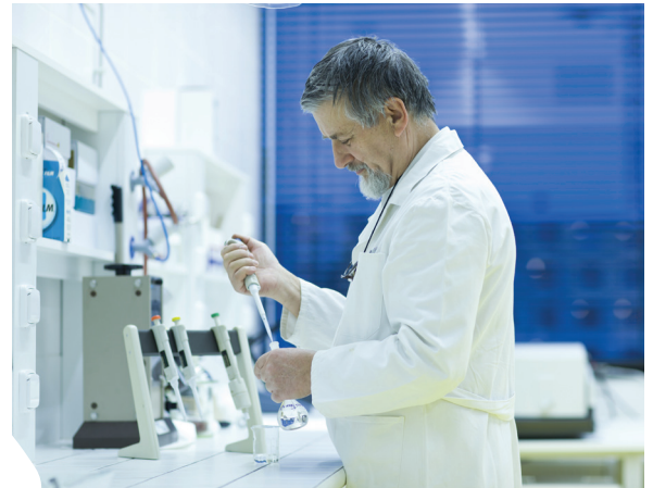
Chemistry that drives innovation